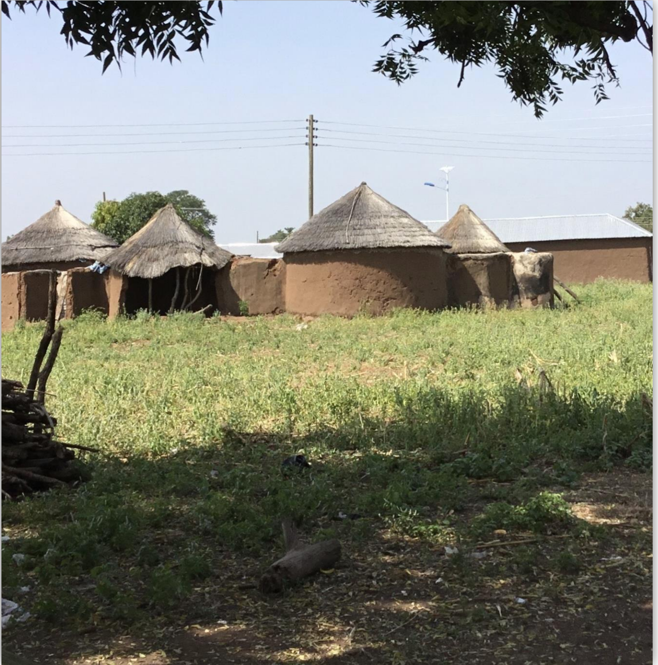
WEST MAMPRUSI, GHANA

The solstice is an astronomical event that is caused by the Earth's tilt on its axis, and its motion in orbit around the sun. The tilt of the earth –not our distance from the sun – is what causes winter and summer. At the December solstice, the Northern Hemisphere is leaning farthest away from the sun for the year.