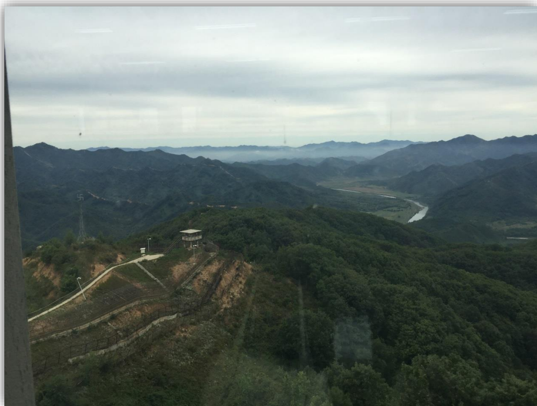
The Korean Demilitarized Zone

The seven day feast of Sukkot will be celebrated from the evening of October 2 to the evening of October 9, 2020.