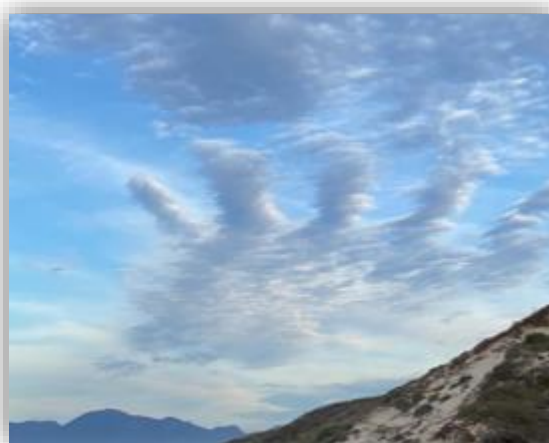
THIS IS THE PICTURE OF THE HAND IN THE CLOUDS OVER TABLE MOUNTAIN

FOR THE AUDIO FILE - VISION OF TABLE MOUNTAIN (PART 2)