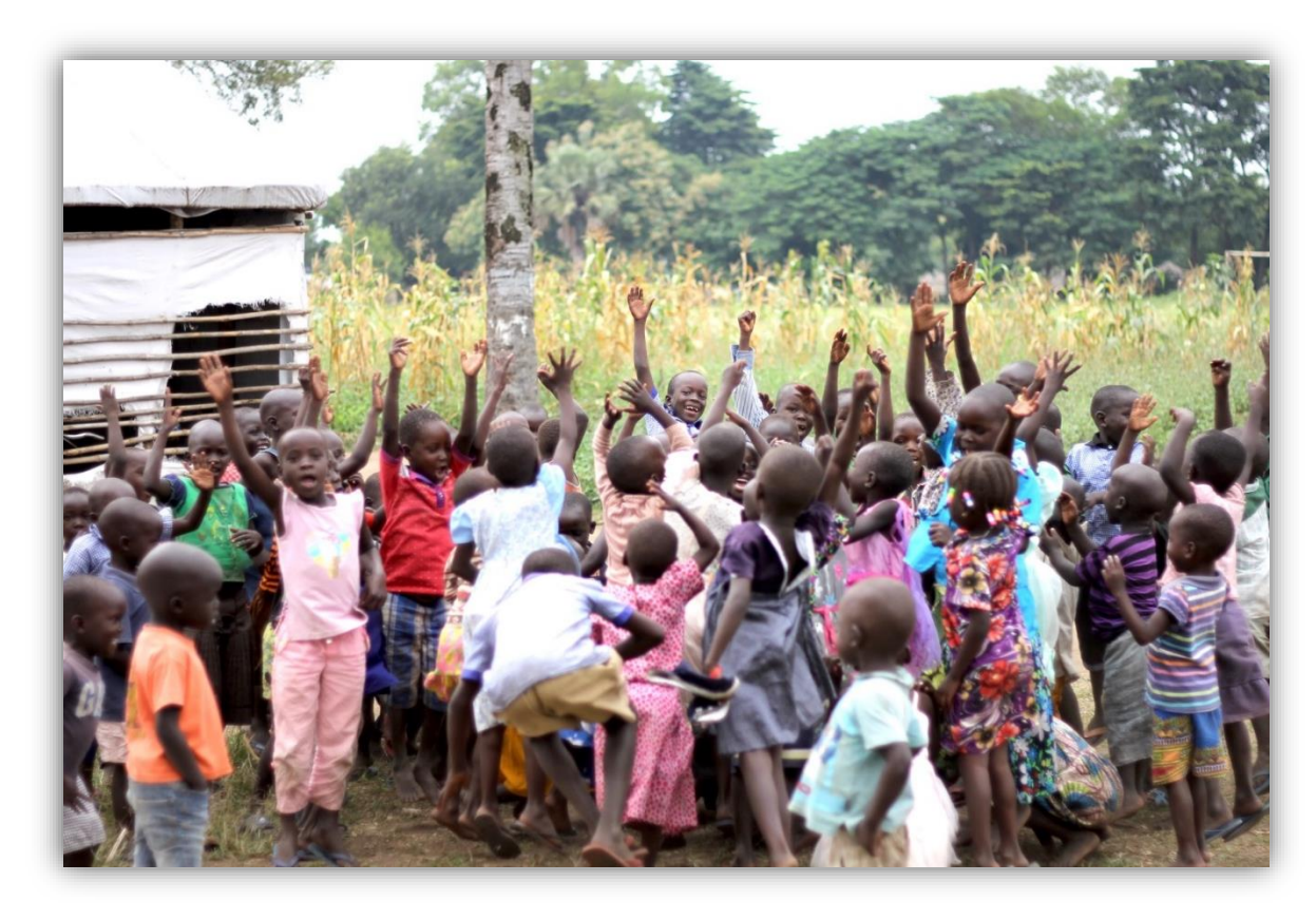
CHILDREN PLAYING AT THE PALORINYA REFUGEE SETTLEMENT, UGANDA

Until the Six-Day War (see "Today in Jewish History" for Iyar 26), the Syrian army was deployed in strong fortifications on the Golan Heights, from which they repeatedly shelled the Israeli settlements below. On the fifth day of the war, the Israeli Army broke through the Syrian front. Facing very difficult topographical conditions, they scaled the steep and rugged heights. The Engineering Corps cleared the way of mines, followed by bulldozers, which leveled a route for the tanks on the rocky face. After more than 24 hours of heavy fighting, the Syrian deployment collapsed, and the Syrian forces fled in retreat.